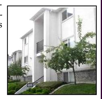
Meet Our Staff

ward to having the Summer Citizens each year. Our staff hosts an opening social, Summer party, Sunday movie nights and so much