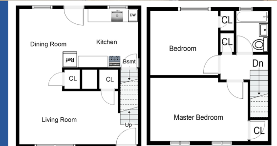
THE CAPITAL 2 Bedrooms • 1 Bathroom • 950 SQ. FT. REMODELED KITCHEN INCLUDES A DISHWASHER AND MICROWAVE