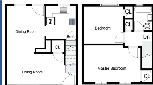
THE ALBANY 2 Bedrooms • 1 Bathroom • 950 SQ. FT.