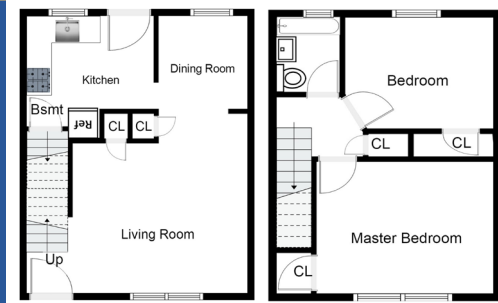
THE HUDSON 2 Bedrooms • 1 Bathroom • 850 SQ. FT.