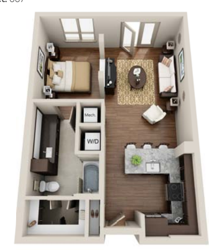
A2 Bedrooms: | Baths: | Square Feet: 688